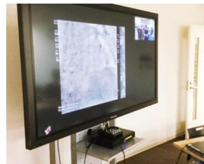
Share medical data to the conference room in real time.