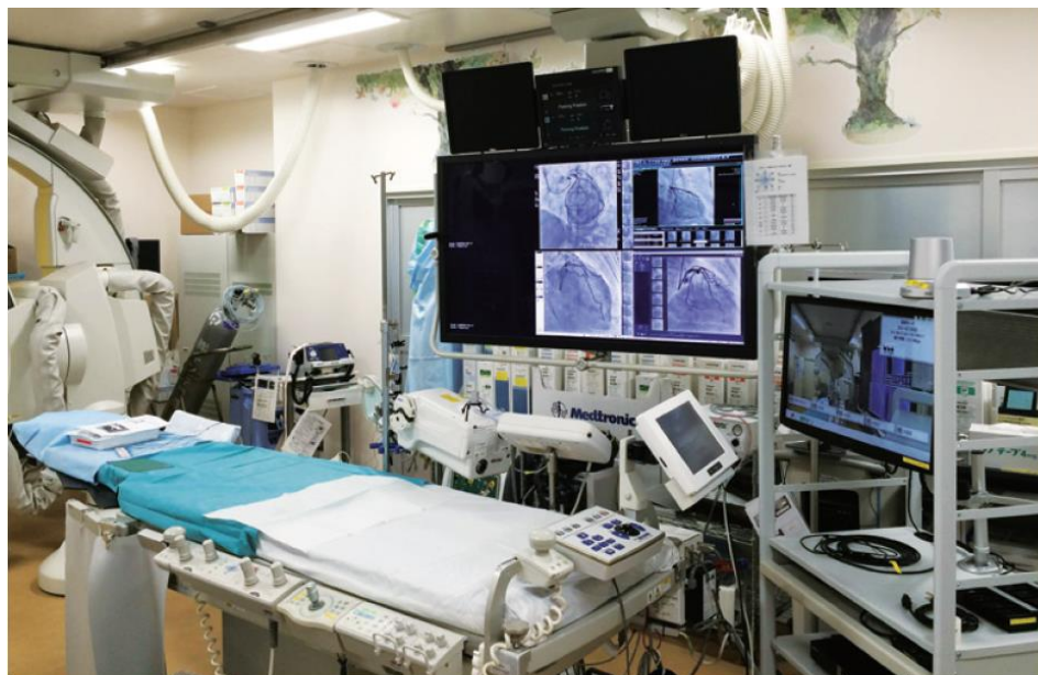
Capture the entire cardiac catheter room with a HDVC camera and check the situation in the conference room in real time.

Medical At the forefront of cardiac catheter treatment, a live system was built that realizes real-time conferences by sharing medical treatment content among physicians.