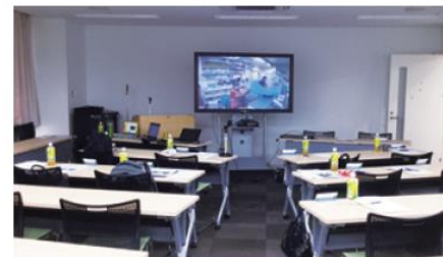
In the conference room, doctors gather and can have a meeting.