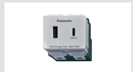
USB Charger 2port 2-port USB Type-A·C