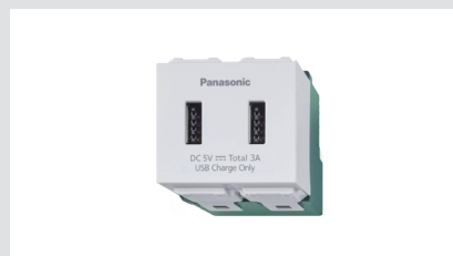
USB Charger 2port 2-port USB Type-A Fast Charger 3A