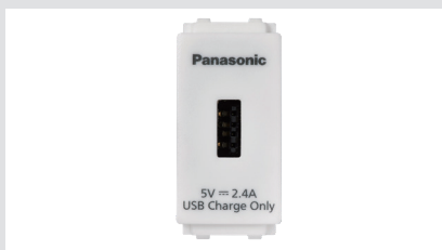
USB Charger 1port 1-port USB Type-A Fast Charger 2.4A