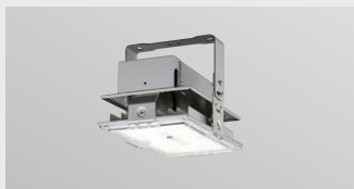
LED High-bay light